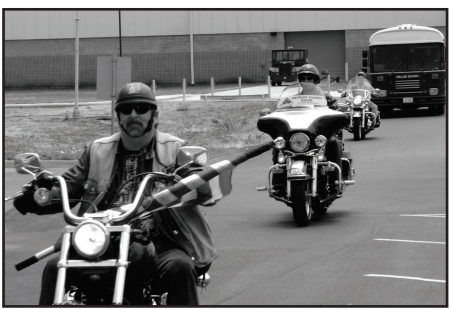
In what has become a Moffett tradition, the Patriot Guard Riders escort the re turning Airmen to their families.