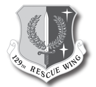
These Things We Do... That Others May Live...