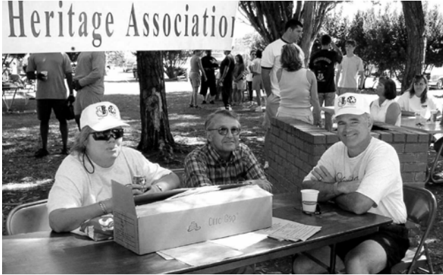
Recruiting at the Family Day Picnic