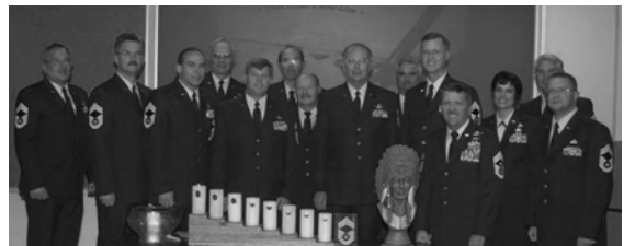
The Chiefs - Old & New