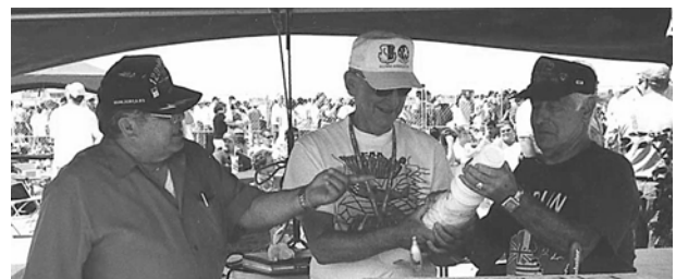
Expert Adult Beverage Servers at the Airshow!