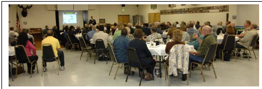
We have a full house for lunch at the 2009 OTL!